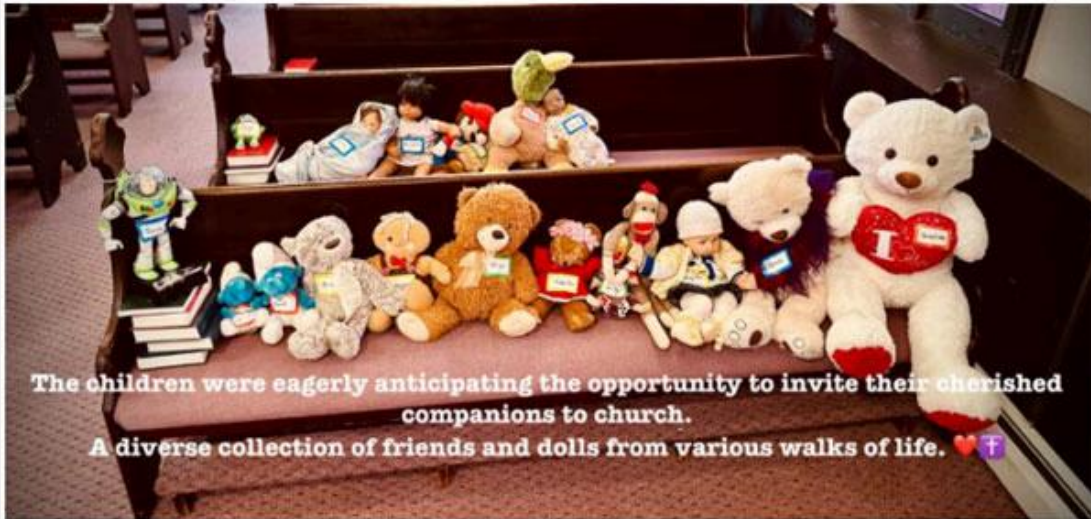
The children were eagerly anticipating the opportunity to invite their cherished companions to church. A diverse collection of friends and dolls from various walks of life. ❤️🙏

Children and their beloved teddy bears, dolls, or plush animal friends were invited to St. Bartholomew Trinity Church in Scottsdale for a child-centered family worship hour on Saturday, May 17. The children's plush animals and dolls stayed after the service for an overnight Bible camp adventure. See all the pictures at www.episcopalpgh.org/stuffed-animal-overnight-retreat/