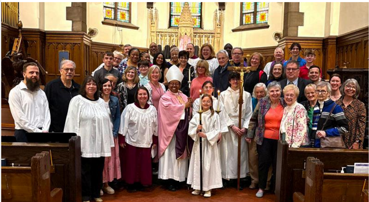
The 10:30 a.m. service