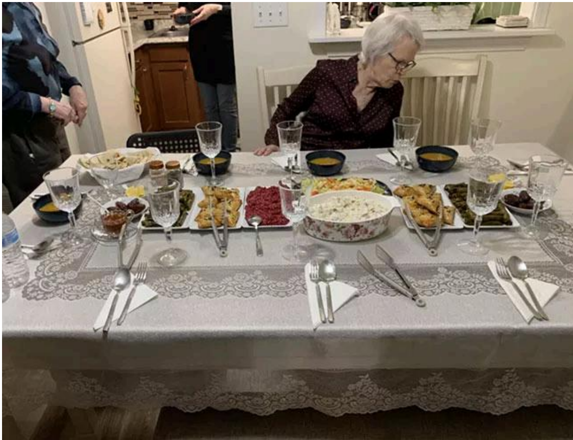
Pittsburgh City Paper Photo by CP Photo: Rachel Wilkinson