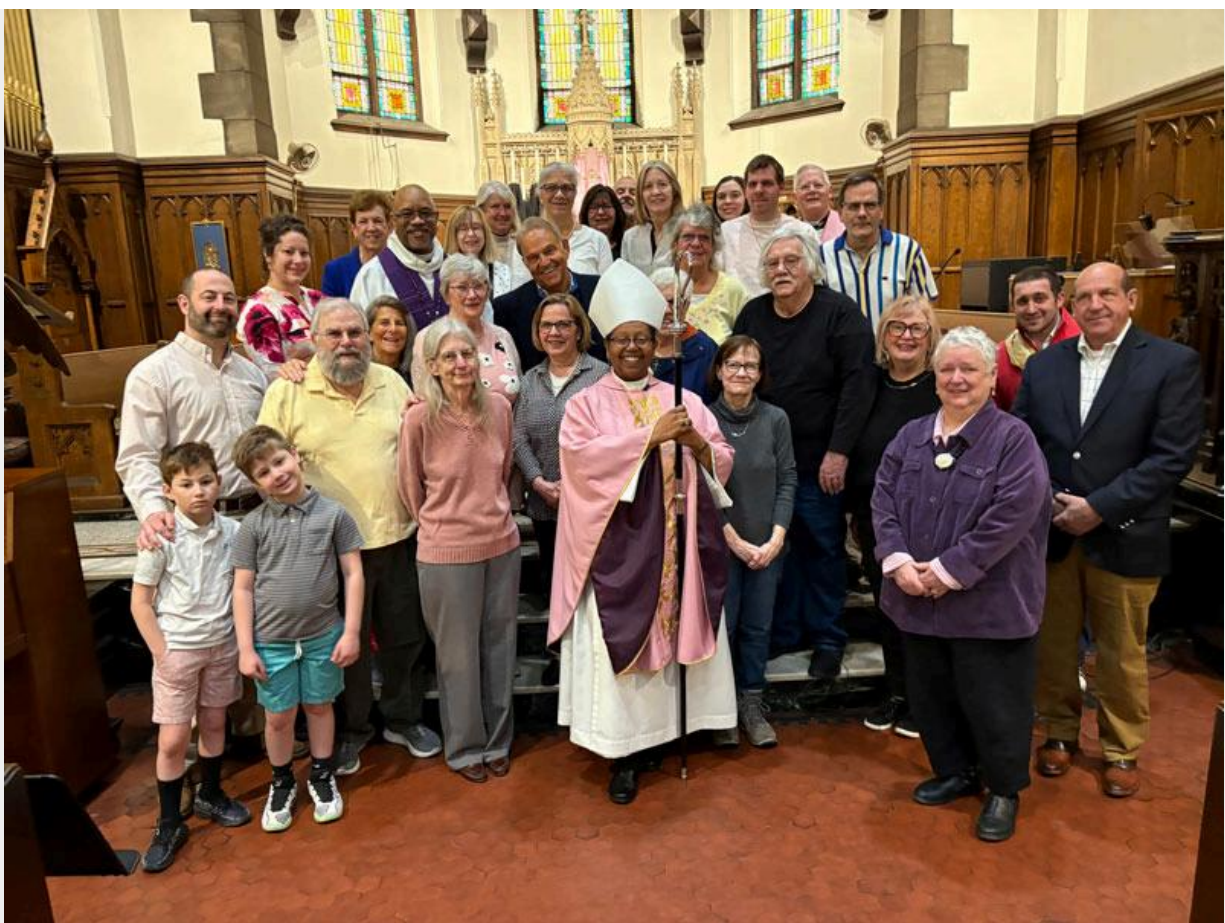
The 8 A.M. service