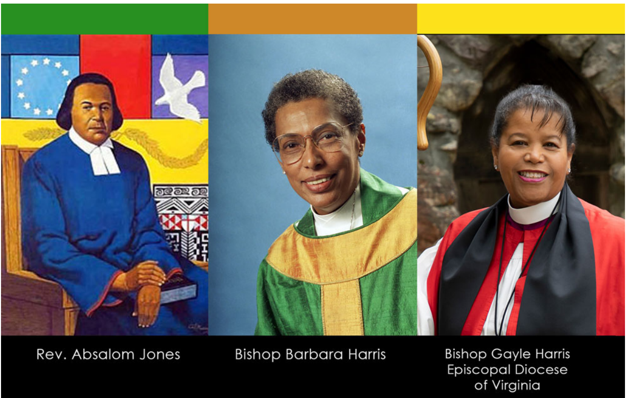
Rev. Absalom Jones