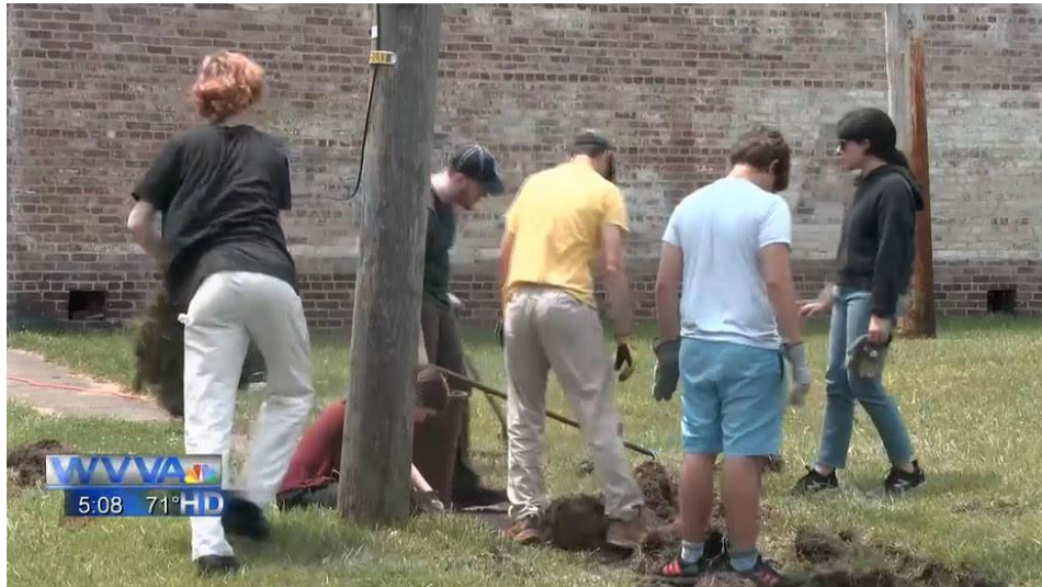
Bluefield's "Serve the Hill" program aids community members