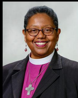
Bishop Ketlen Solak Episcopal Diocese of Pittsburgh