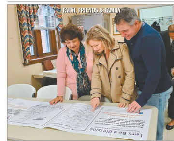
Parishioners look at results of their campaign at St. Thomas' Episcopal Church in Canonsburg last month.

OBSERVER-REPORTER FRIDAY, NOVEMBER 16, 2018 PAGE A6