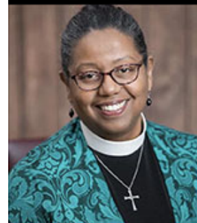
Bishop Ketlen Solak Episcopal Diocese of Pittsburgh