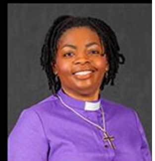
Bishop Cynthia Moore-Koikoi Western PA Conference United Methodist Church