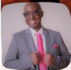
Directed By Walt Blocker from The Historic Episcopal Church of St Thomas, Philadelphia, PA