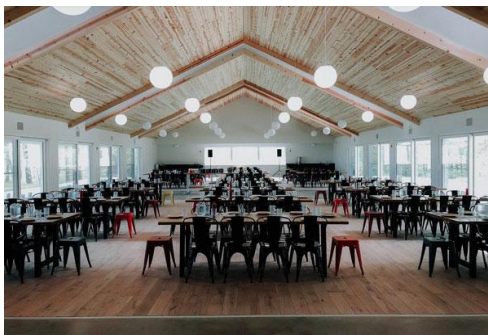
New Dining Hall all set for "The First Supper"

Limited space is still available this summer during the following sessions: Coed session II, June 23-29; the Stars & Stripes session, June 30-July 6; and Ready, Set, Camp, June 30 - July 3.