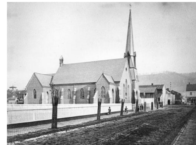
St. Mark's in 1874 before the flood