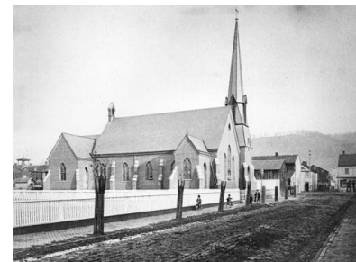
St. Mark's in 1874 before the flood