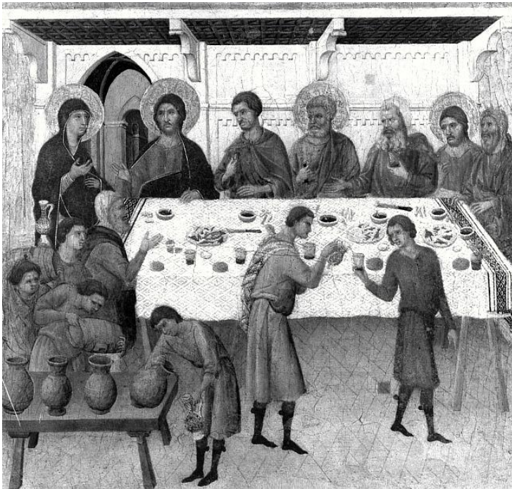
Wedding at Cana Duccio di Buoninsegna (1308-1311)